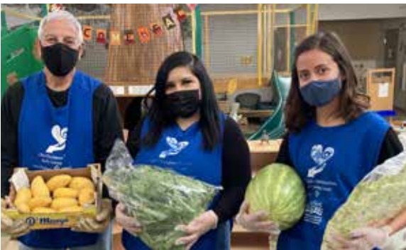
CDI ELC volunteers distribute food to families in the community.