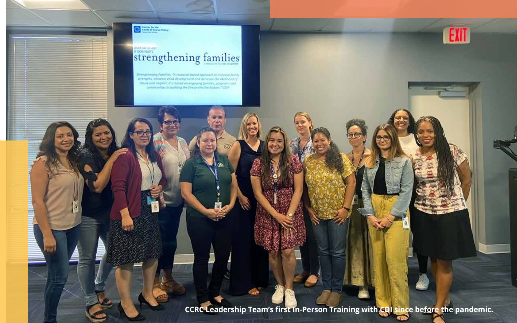
CCRC Leadership Team's first In-Person Training with CDI since before the pandemic.

of trauma. Obtaining deeper levels of knowledge, understanding and specialized interventions to use with these children can help mitigate future challenging behaviors and help children feel safe and successful. This comprehensive series provides the essential components of the long term investment needed to integrate the trauma informed care principles of compassion, reflection and resilience into an organizations culture.