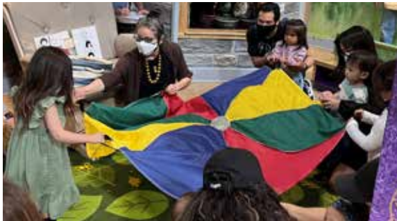
Children participate in group activities at CDI's ELC Reseda.