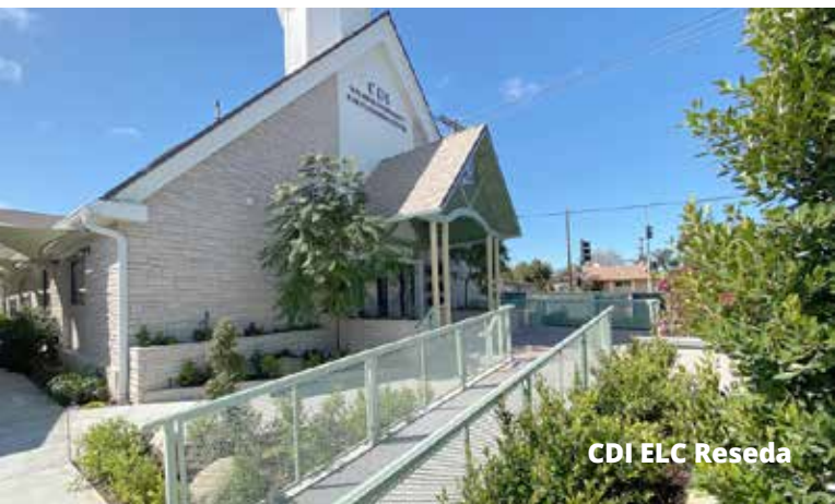
CDI ELC Reseda

Located in Reseda and Canoga Park, CDI's Early Learning Centers offer a museum-quality, developmentally-appropriate play and learning space for children and their families.