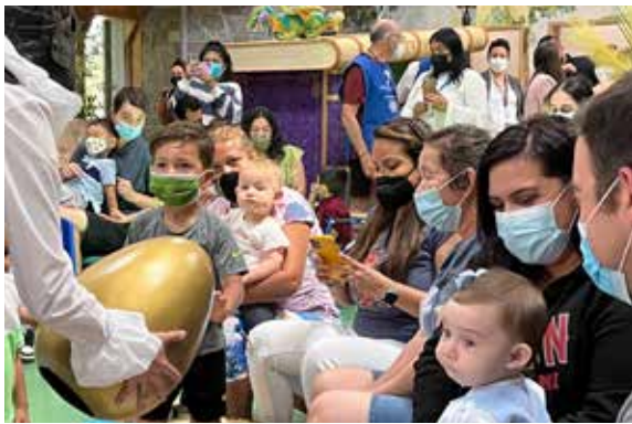
The LA Opera provided a day of music for babies and toddlers at CDI's Early Learning Center in Reseda, engaging them in the rich experience of opera.